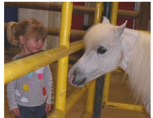
Dreamer and admirer

Felicia observed that people liked how their kids did not fear the Miniatures the way they were afraid of big horses and would engage with the Miniatures in a way they couldn't with big horses.