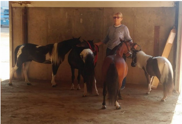
Robin and the show string