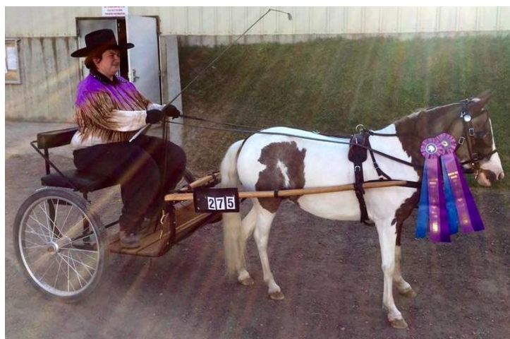
Felicia and Elsa Western Pleasure Driving Stakes Over