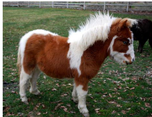
Foxy Boy 2014