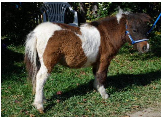
China Doll (Sassy) 2013