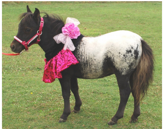
Pixie dressed in pink