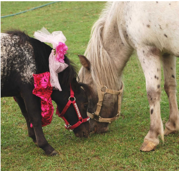
Pixie and her dam

We also appeared at the Tractor store with Patches; that day, Patches tried to eat my hot dog that was in a paper container. Out of the corner of my eye, I saw it disappearing and grabbed it just in time!