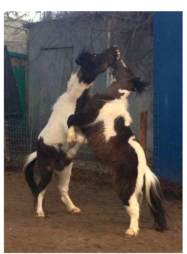
Chance and Comanche celebrating their Spring head and neck clips