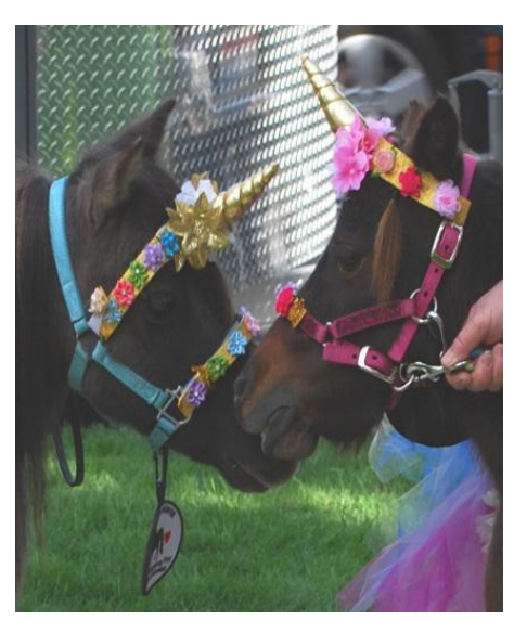
Thunderpants and Juliet