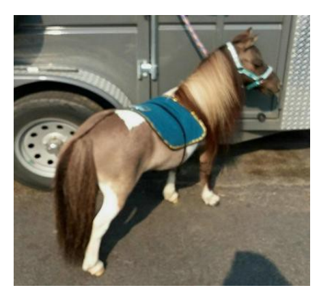
Thunderpants in his Abode vest

We love what we do with our mini's, the smiles and sometimes a break through with patients that haven't spoken a word in months. Just petting a mini and loving on them and hearing someone say - "Oh baby, you are so soft" is all we need to know we made someone's day just a little bit better.