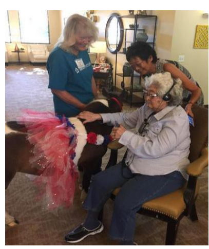
Sassy in her red, white, and blue tutu