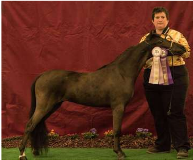
SP She's To Hot To Handle aka Brandy 8th AMHR Solid Color Mares Over