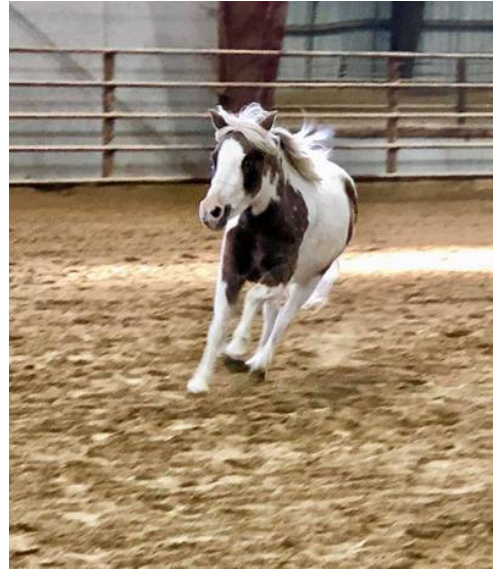
SP Dressed With A Splash of Elegance aka Elsa 2nd AMHR Cool Jumper 3rd AMHR Cool Driving Obstacle 4th AMHR Cool Halter 5th AMHR Cool Western Country Pleasure Driving 7th AMHR Cool Roadster 7th AMHR Cool Showmanship with me 9th AMHR Cool Hunter

Look for current/future Show Bills on the Events page of the website, and please share updated info with Pam to post events. pete_macfarlane@hotmail.com