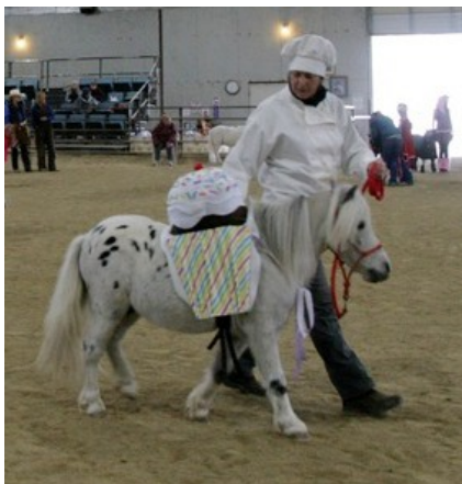
2019 Halloween play day

My other occupation is as an Equine Massage Therapist. I was certified in Hamilton Montana in April of 2019. I thoroughly enjoy bringing relaxation and pain relief to our equine friends. We ask a lot of them and sometimes they do not get enough in return, in my opinion. This is my way of returning all of the good things they do for me and I get to be around them on a regular basis. This is heaven on earth for me!