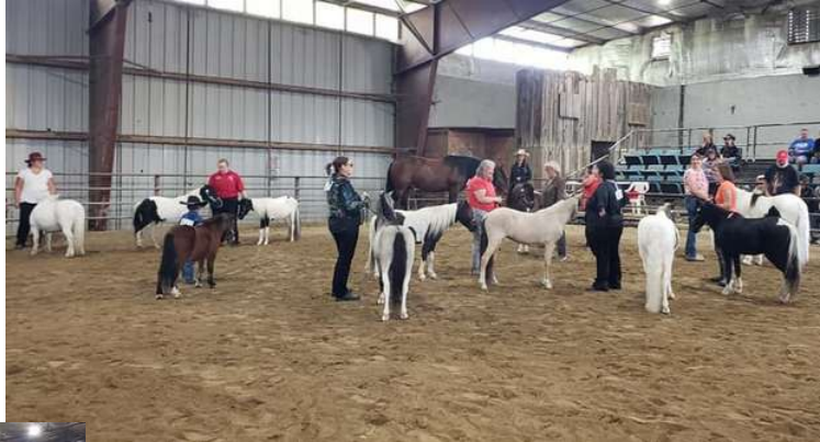
Waiting for a class