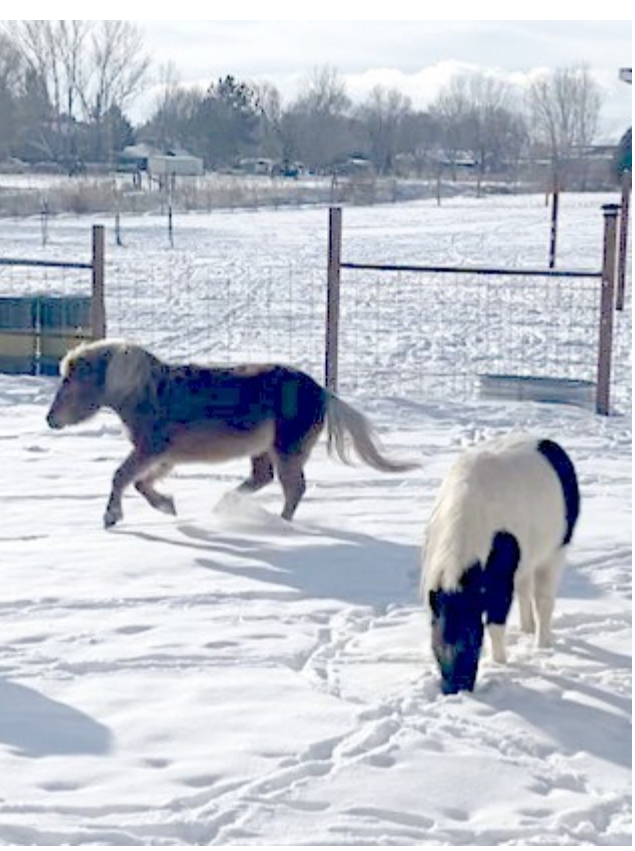
Stormy and Hippie