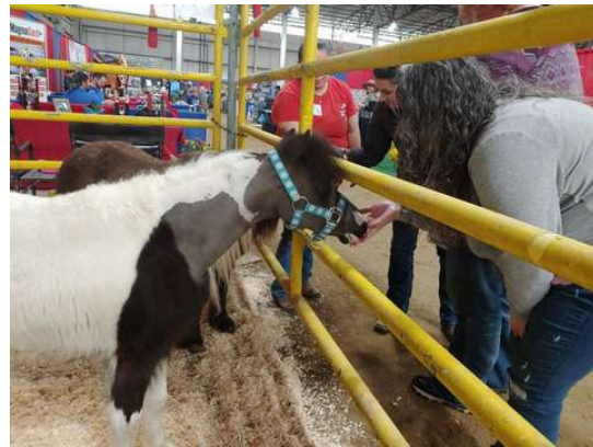
Adults adoring Ritzy