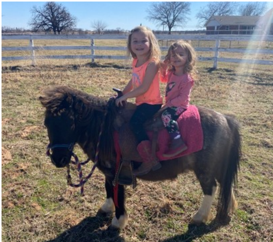
Looking relaxed, Blu carries two happy girls on his back!

Thanks to Lois for sharing the sweet photos!