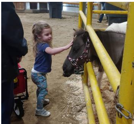
Toddler petting soft Sunny