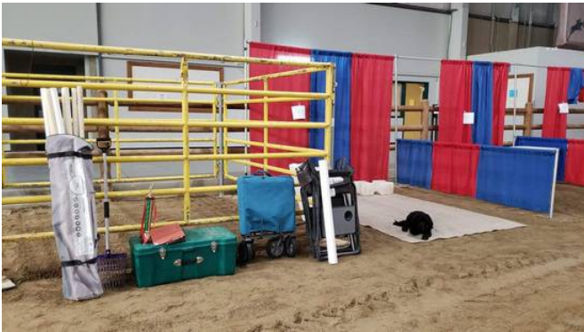
Before setting up