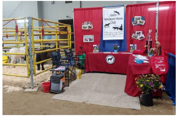
Ready for admirers: Ritzy and Sunny