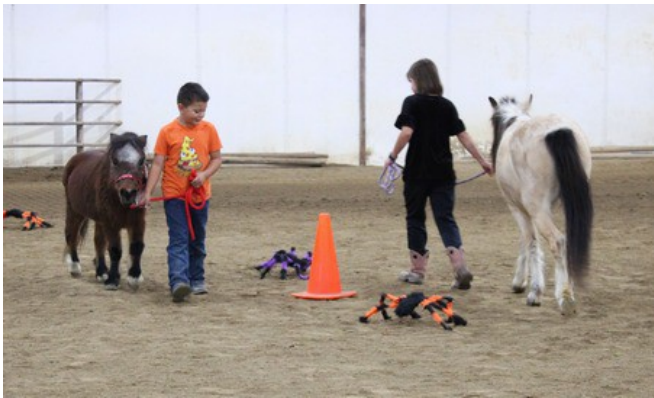
Youth Musical Cones