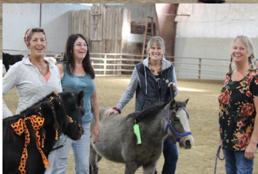
happiness with friends and horses