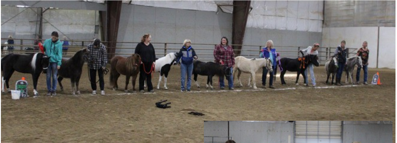
Adult sock race