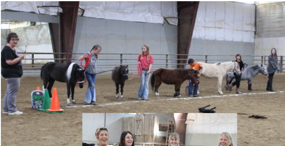
Youth Broomstick Race