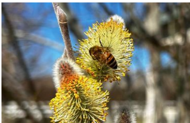
Hungry bee feasting on pussywillow pollen