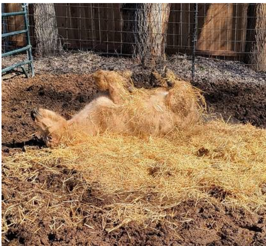
Val's Bernie enjoying fresh straw